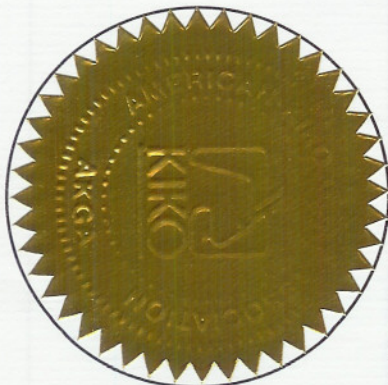
Registered Seal American Kiko Goat Association