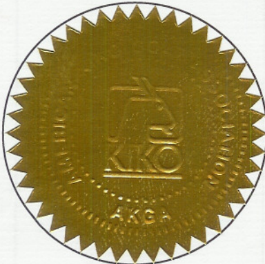
Registered Seal American Kiko Goat Association